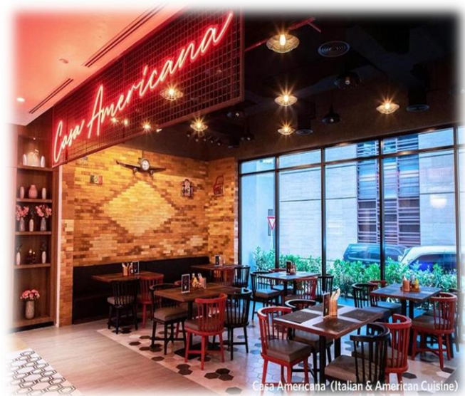
Casa Americana (Italian & American Cuisine)