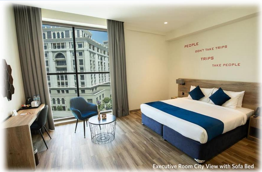
Executive Room City View with Sofa Bed