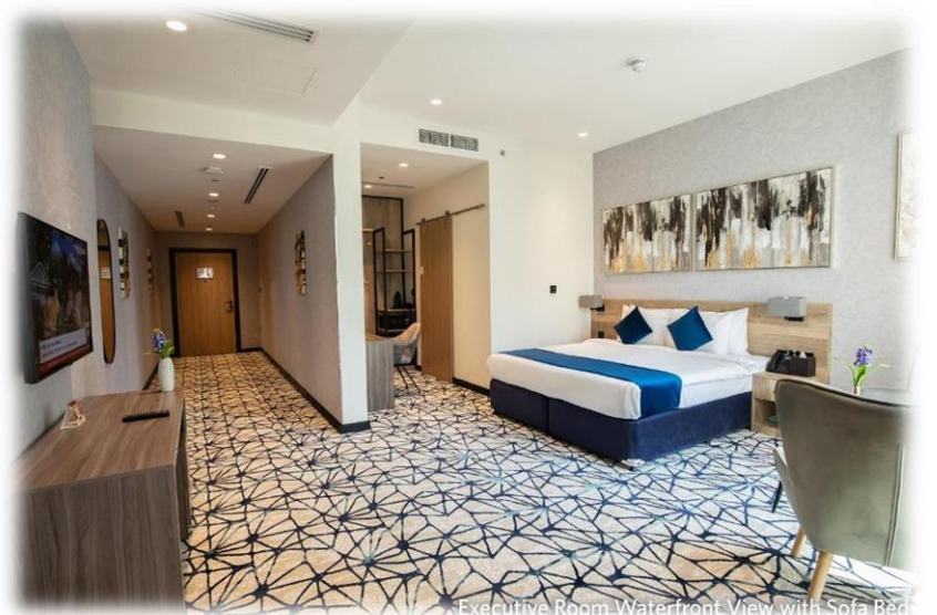
Executive Room Waterfront View with Sofa Bed