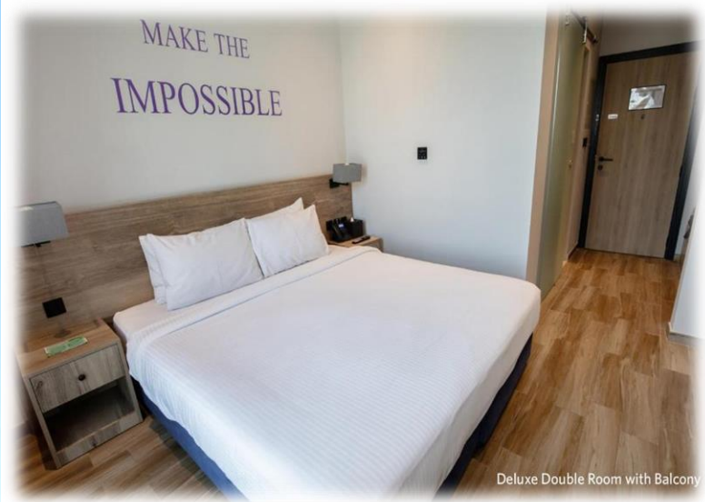
Deluxe Double Room with Balcony