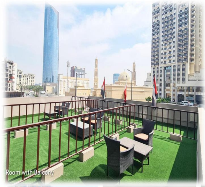
Room with Balcony